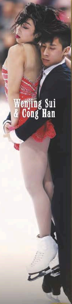
Wenjing Sui & Cong Han