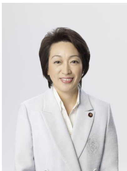
Seiko Hashimoto President Japan Skating Federation